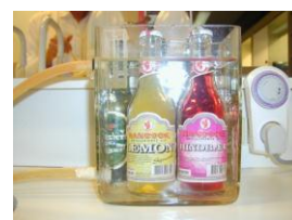
Durability test in ice water

PRO-GLUE have a large range of hot melts adhesives, designed for most types of containers and packaging material.