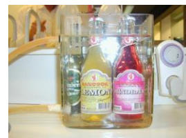
Durability test in ice water

PRO-GLUE have a large range of hot melts adhesives, designed for most types of containers and packaging material.